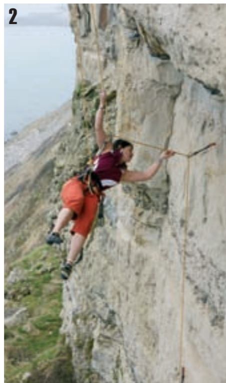
1. Before you lower off clip a quickdraw between your harness central loop and the rope. This will hold you in next to the route and rock.