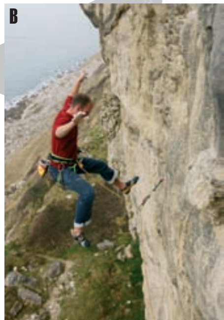
Photo B. Good in-flight body position! Note the climber has pushed away from the rock slightly to avoid getting scuffed and is using his arms to keep a stable, upright body position in the air.