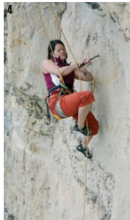
3. Grab the quickdraw. You may be able to flick it off the bolt at this point if there's not too much weight on it. If this doesn't work re-clip the extra quickdraw below the bolt. Then you have a choice. Either...