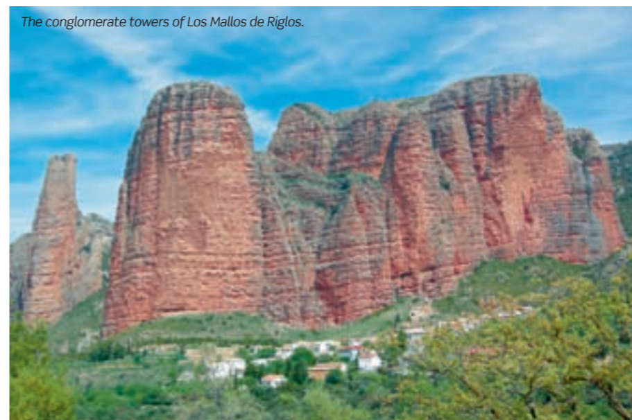
The conglomerate towers of Los Mallos de Riglos.

If you can escape the attractions of Barcelona for a few hours then Montserrat awaits. First visits are often disappointing because you can spend ages navigating the maze of options. Get some local advice and you'll have a great time. But leave time for a visit to Riglos – it's superb. Moskitos (F6b) is the gentle option on the big steep tower of La Visera. You get a great view of Fiesta de los Biceps the wild and ultra-classic F7a and you'll definitely be back for more.