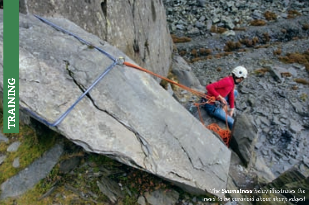
The Seamstress belay illustrates the need to be paranoid about sharp edges!