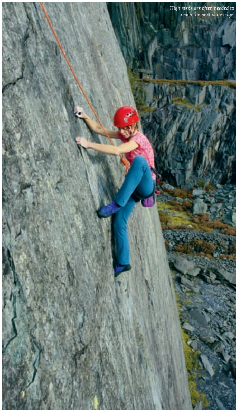
High steps are often needed to reach the next slate edge.

Sedimentary rocks are composed of the eroded particles of igneous rocks broken off in chunks high in the mountains and carried by ice and rivers in ever smaller grains towards the sea. These mud and sand sediments, plus minerals and other organic and biogenic particles, are laid down in layers beneath the sea. Over time these soft