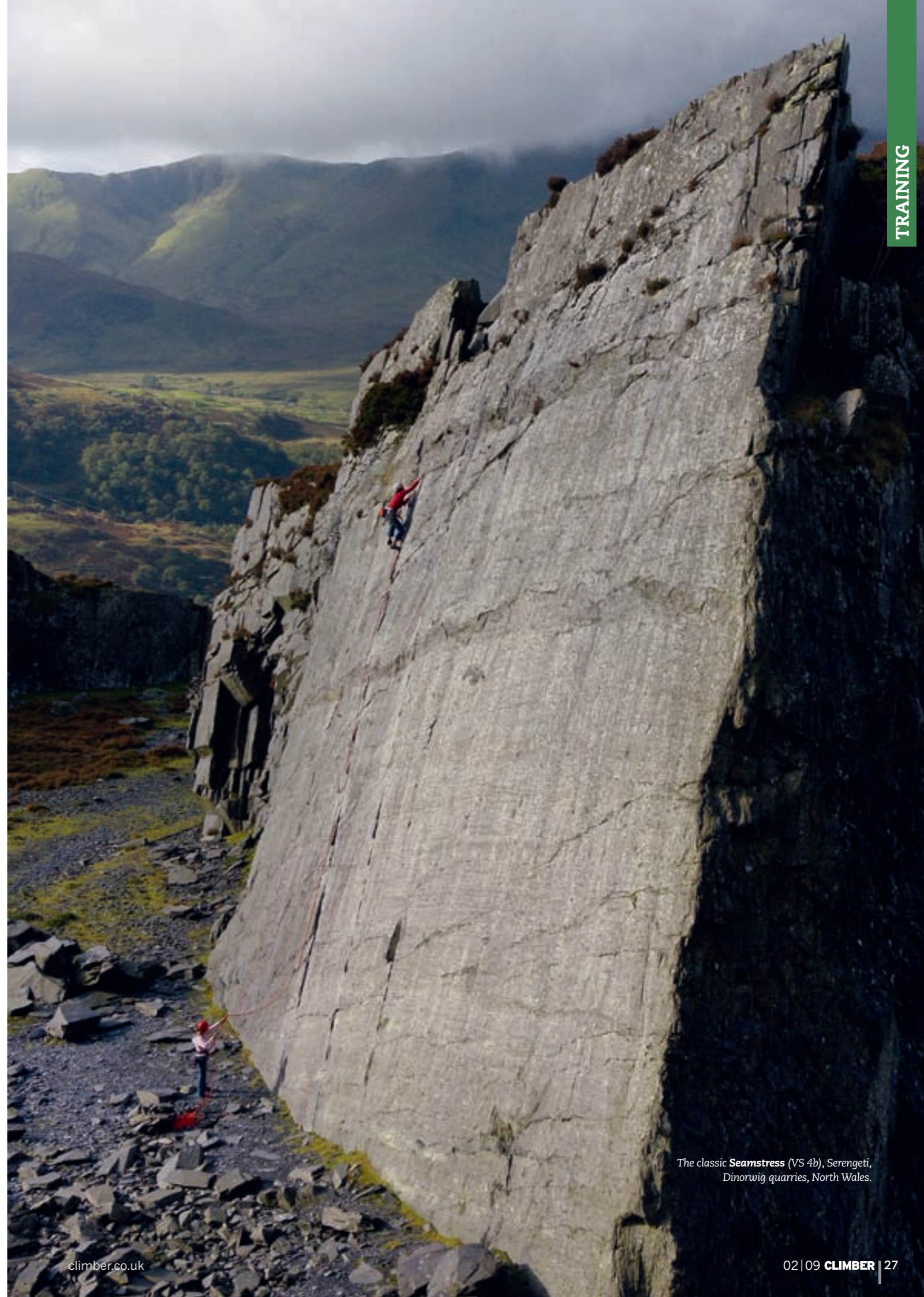
The classic Seamstress (VS 4b), Serengeti, Dinorwig quarries, North Wales.