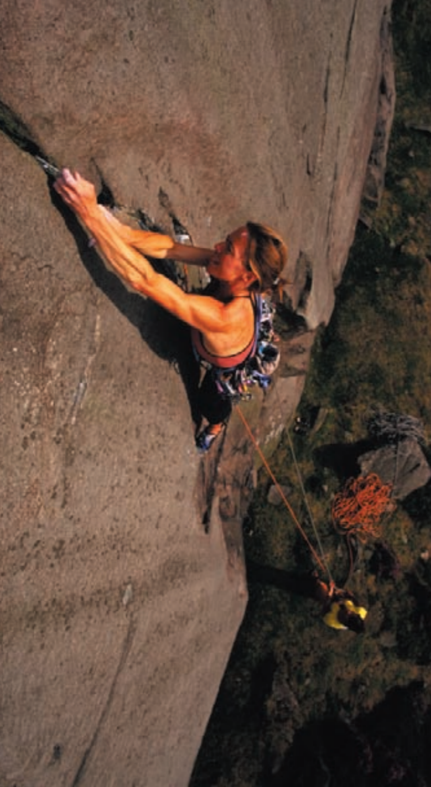
▲ Getting comfortable in awkward spots to place gear is crucial as the crux is close to the ground.